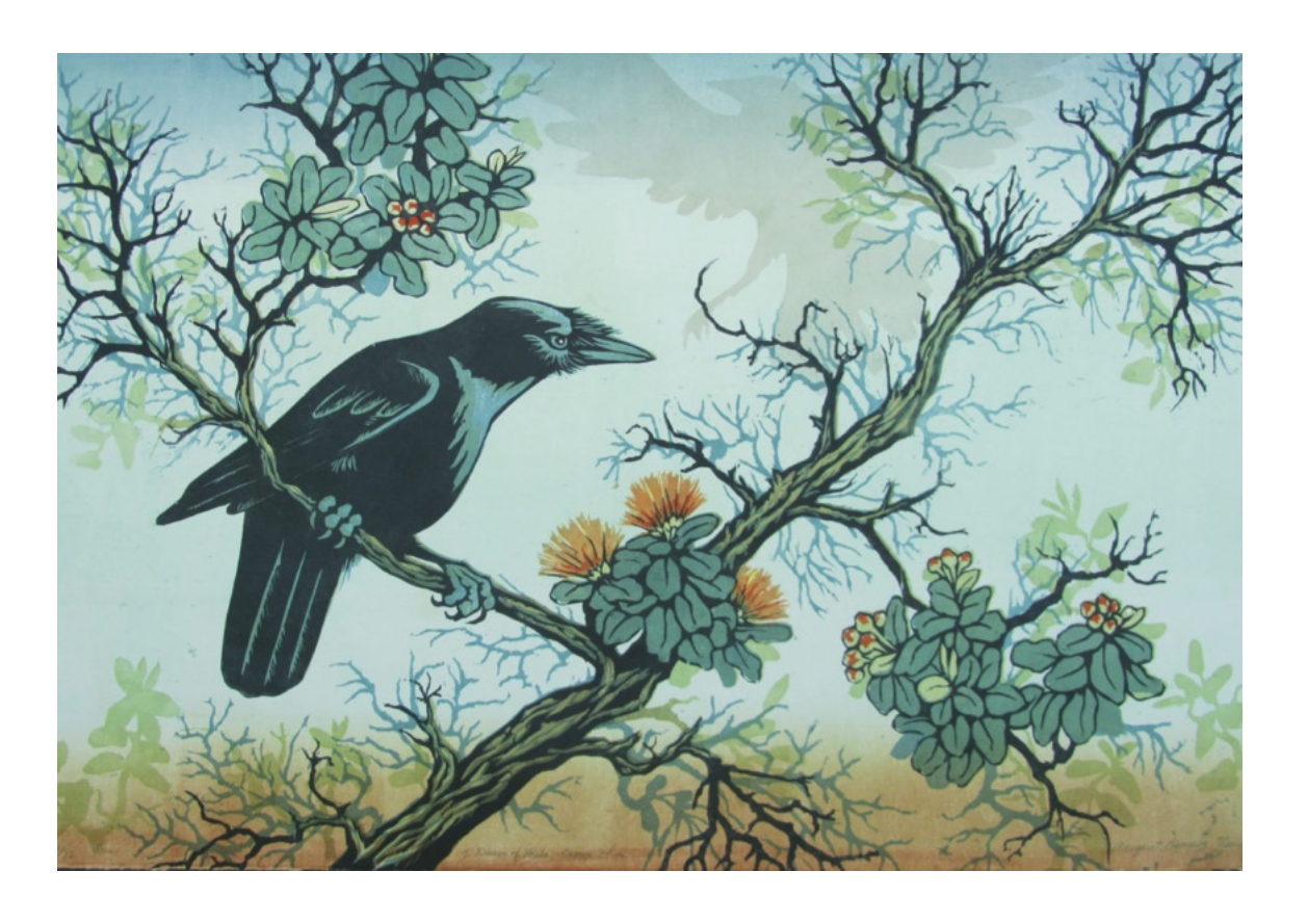
I Dream of 'Alala, Orange 'Ohia

All of the prints reproduced here are multiple plate wood block prints ( 30'' \times 44'' ). They are titled: 1.) I Dream of 'Alala, Orange 'Ohia; 2.) No Safe Haven; 3.) Second Chances; 4.) Second Wind; 5.) Once in a Blue Moon.