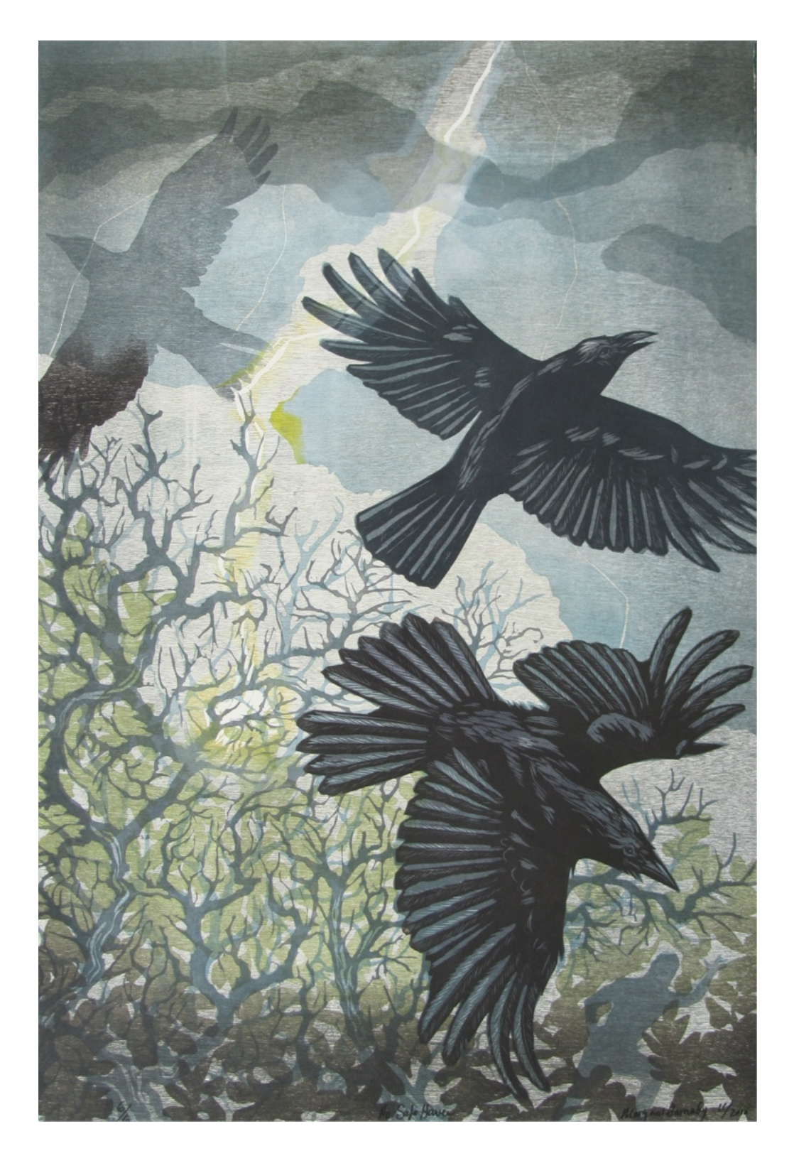
No Safe Haven